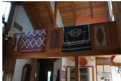
Looking up to the loft