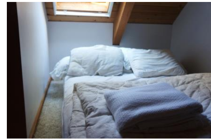
Queen in upstairs bunkroom