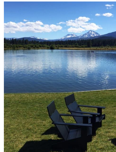
Phalarope Lake at BBR